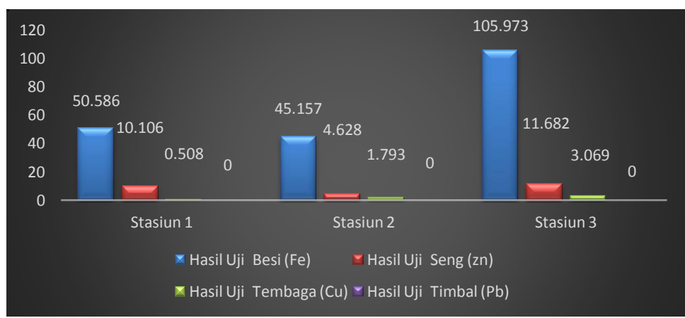
Figure-3 The Accumulation Metal for each Station (mg/kg)

The resulting research showed that the accumulation metal Copper (Cu), Iron (Fe), and Zinc (Zn) on each research station was differentiated. For more detail, you can see from the figure-3