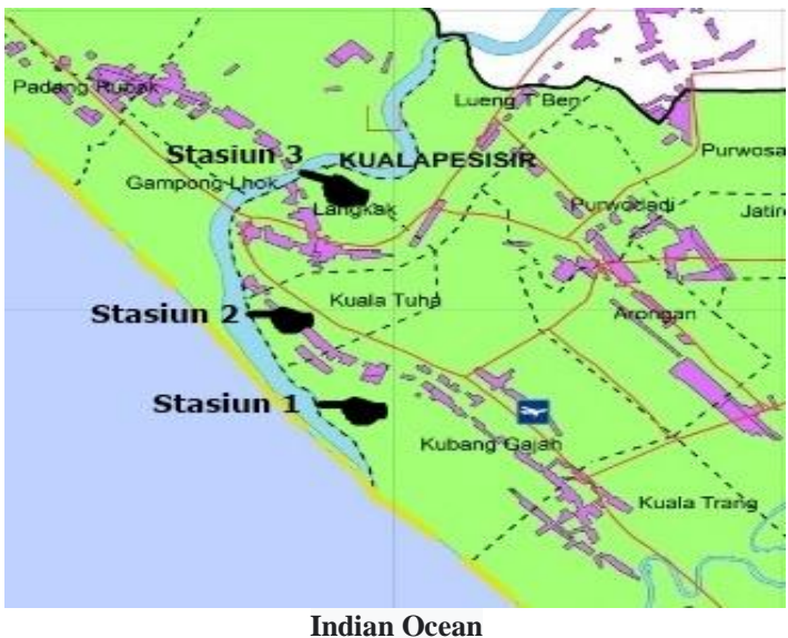
Figure-2 Sketches of Research Sites

The method used in this research is an exploratory survey, consisting of 3 stations, and at each station, there are 3 sampling points, the determination of each sampling point is carried out by purposive sampling. Destructive sampling was carried out and was repeated 3 times. For more details, the station determination can be seen in Figure 2.